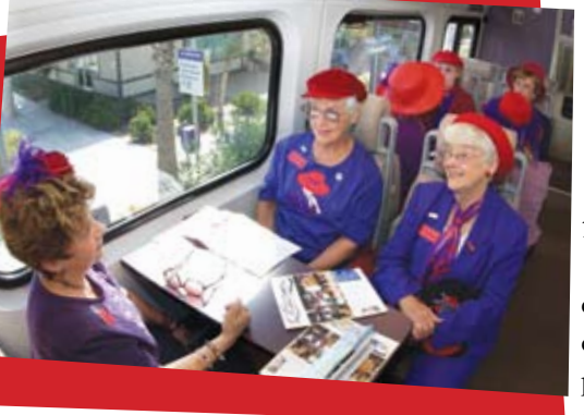
Even the Red Hat Ladies take Metrolink.

For more information on group-travel packages or to make reservations, please contact Metrolink at (800) 371-LINK (5465).