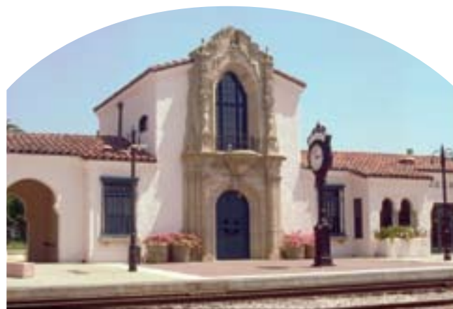
Claremont Metrolink Station

The new Packing House showcases a vibrant mix of the old and the new, with historical fixtures such as dramatic