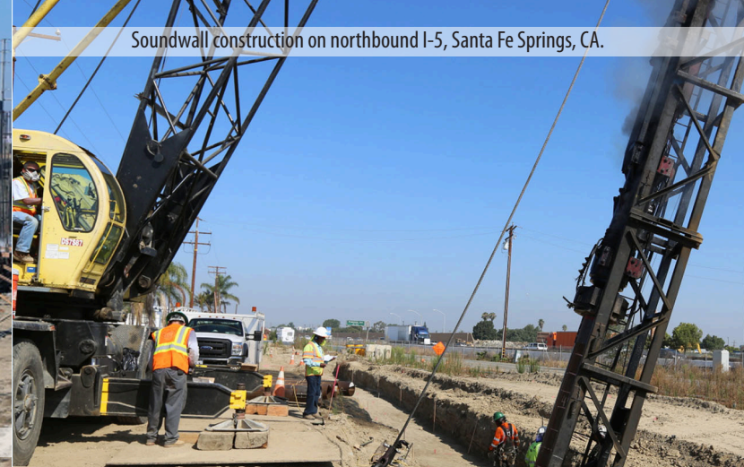
Soundwall construction on northbound I-5, Santa Fe Springs, CA.