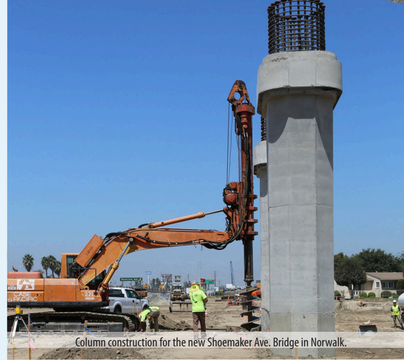
Column construction for the new Shoemaker Ave. Bridge in Norwalk.