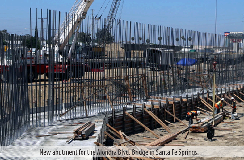
New abutment for the Alondra Blvd. Bridge in Santa Fe Springs.