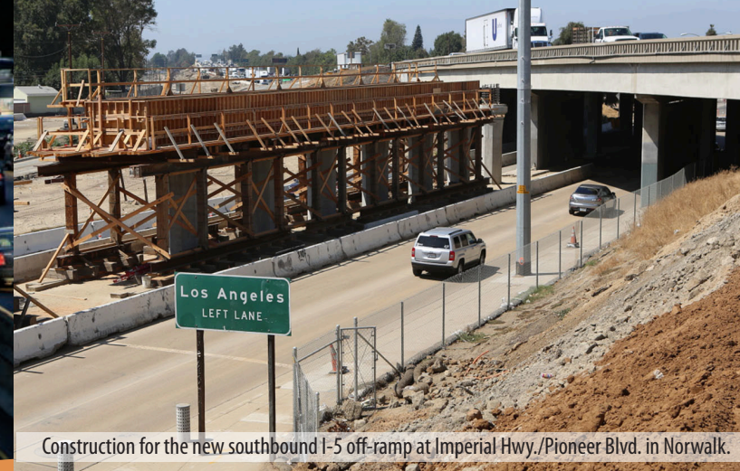
Construction for the new southbound I-5 off-ramp at Imperial Hwy./Pioneer Blvd. in Norwalk.