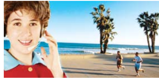
Beach photo courtesy of the Ventura Visitors and Convention Bureau.

We thank all passengers for their patience and understanding as the project is completed.