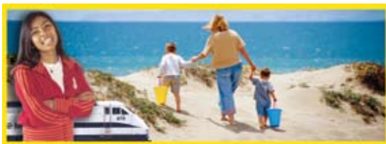
Beach photo courtesy of the Ventura Visitors and Convention Bureau.