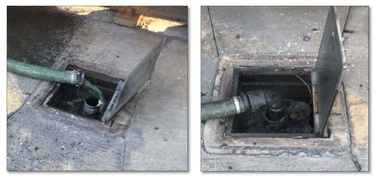
Ex. 16- Improper Connection