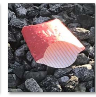
Ex. 13 Bottle Cap/Misc.