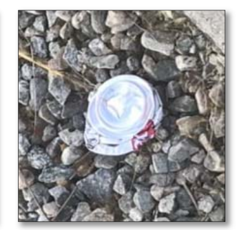
Ex. 14 – Water Bottle