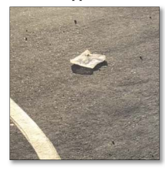
Ex. 9 – Paper towel